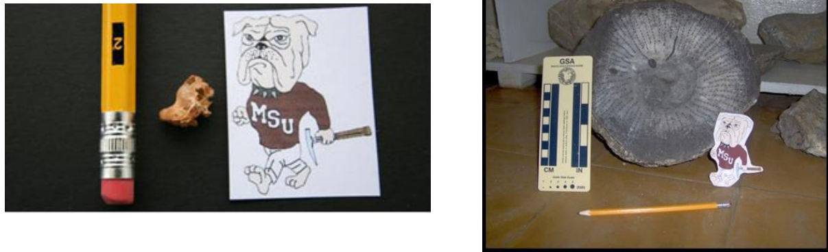
Figure 3. Fossils represented all major phyla, and ranged from Precambrian to Pleistocene in age. Many fossils selected by practicing teachers for inclusion were often collected within their local geographic areas. These included a Pleistocene bat skull, Phylum Chordata (left), courtesy of Nancy Albury and (right) a Puerto Rican rudist (an extinct bivalve, Phylum Mollusca, that contributed heavily to Cretaceous reefs of the US Gulf Coast) , courtesy of Janette Stewart.

paleoenvironmental analyses, the local environment was always included by our practicing teachers. The environments of deposition included both terrestrial and marine environments. Because our practicing teachers reside in several very different geographic areas, the fossils, paleoenvironments, and geologic times represented were quite diverse. Tar seeps, coal swamps, glacial moraines, lacustrine, turbid marine, deep marine, and reef environments--from a wide range of geologic time--were discussed as paleoenvironments by our practicing teachers.