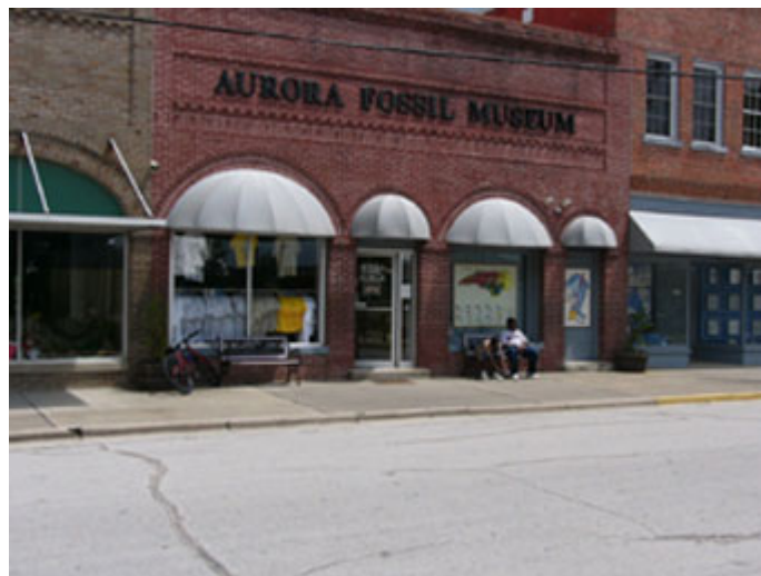
Figure 2. Famous museums, such as the Field Museum in Chicago, Illinois (left) were included in students' research. However, students who were not in geographic proximity to the larger, more famous sites were still able to find local museums and informal education environments that featured fossils. The Aurora Fossil Museum (right) is located in North Carolina.

In general, project submissions for both semesters were excellent, and students demonstrated knowledge of the paleontology content, as well as effective application and synthesis of the material. In both years, the photographed specimens were representative of all the invertebrate phyla, and several vertebrate orders and plant divisions. Figure 3 shows a representation of included fossils. Ichnofossils, especially track ways, were popular fossil choices for both classes. Not only were fossils diverse in their morphology, but both 2007 and 2008 practicing teachers photographed specimens from the Precambrian through the Pleistocene Epoch, encompassing most of the Earth's geologic history.