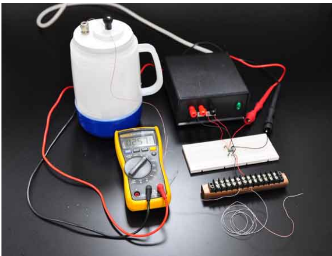
Figure 3. The experimental set-up.

thermocouple to room temperature we registered an amplified Seebeck voltage of 257 mV. In order to obtain the actual (pre-amplified) Seebeck voltage ( E ), one must divide the amplified voltage by the circuit gain ( G ). In this case, we divided 257 mV by our gain of = 225 to obtain an actual Seebeck voltage of E = 1.14 mV. To further demonstrate the Seebeck effect, we submerged the measuring thermocouple in both an ice bath and then a kettle containing boiling water. Based on our measurements, we calculated actual (pre-amplified) Seebeck voltages of 0 mV and 5.23 mV respectively. The recorded Seebeck voltages can be easily converted to temperature using either reference tables or inverse polynomials as defined by the International Temperature Scale of 1990, ITS-90 (U.S. Secretary of Commerce, 1995). Table 2 summarizes our measurements and their corresponding calculated temperatures using the ITS-90 J-type thermocouple reference table.